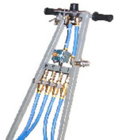
Bottom: Operator control area of the push handle assembly showing the handle bar grips, trigger control switch and air inlet from shop air supply.

For comprehensive information on air film technology and how air bearings work, check out the manufacturer's web site: www.hovair.com