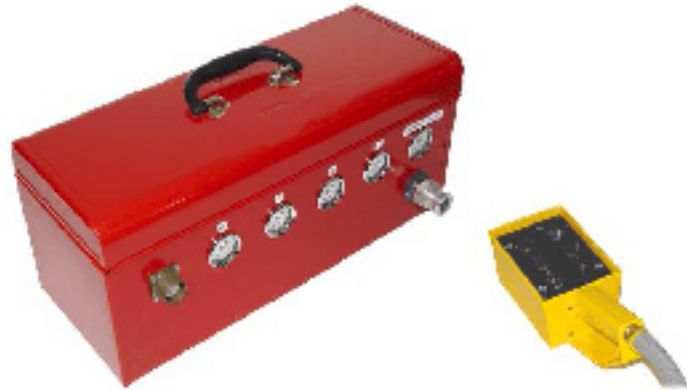
Above: A typical AirGlide Systems remote control unit complete with hand held control pendant.

Lockheed Martin, Boeing, Cirque du Soleil, Goodrich Aerostructures and Pilkington all use pneumatic powered air skate load moving systems