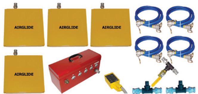
An AirGlide square aluminium air bearing system