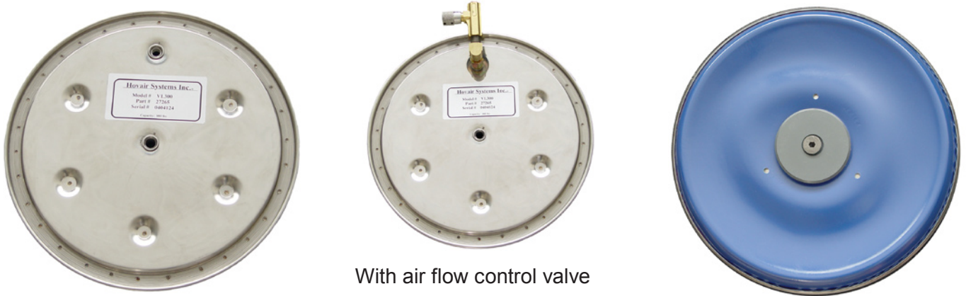
With air flow control valve