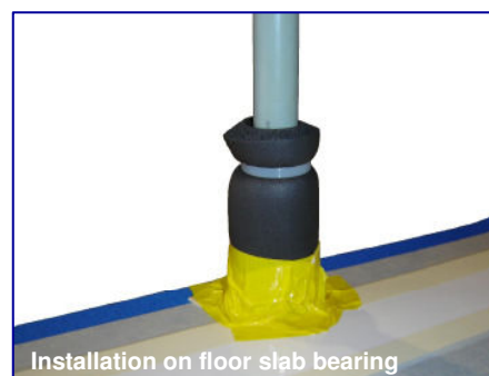
Installation on floor slab bearing

Installation of the LASTO®ISOSWIFT bridging system prevents noise transmission where pipes pass through openings in the structure. The LASTO®ISOSWIFT system is simply pressed into position around the pipe after an acoustic bearing has been installed. The large, solid rubber base covers the cutouts for the pipe in the acoustic bearing. Adhesive tape suitable for concrete is used to seal the overlaps to the acoustic bearing and the pipe padding firmly secured to the pipe, using the cable tie supplied.