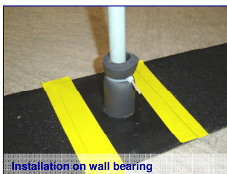
Installation on wall bearing